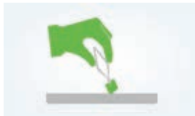
Manual Hematopoietic Reduction