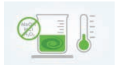
Cold Isotonic Cleansing