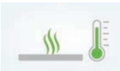
Gentle and Gradual Dehydration