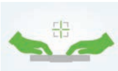
Precise Cutting Die Placement