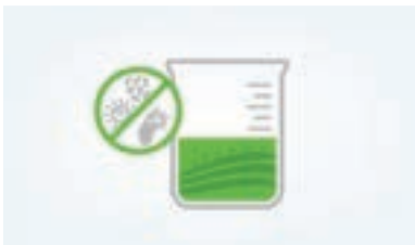
Minimally Invasive Disinfection

The patented six-step BioRetain ® process is gentle, minimally invasive, and preserves the natural integrity of the amniotic tissue/ components critical to the inherent wound healing process.