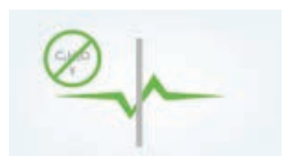
Low-dose E-beam Terminal Sterilization